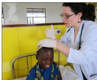
Treating a patient at the hill-top hospital in northern Rwanda

Like the other times I have returned home from abroad, I welcome the familiarity of things. I love understanding the subtleties of language and knowing how to greet someone without seeming awkward. I like the hot showers and my spring mattress and the coffee shop on the corner. But, inevitably I miss what has become my home away from home. This time, I miss the hospital on the terraced green hill-top in northern Rwanda.