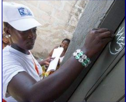
A Rotary volunteer marks a door during National Immunization Days in Côte d'Ivoire