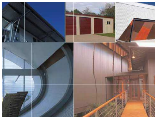
Some amazing applications of Bluescope products!

Since the GFC, we concentrate on doing more with less money and less people. The only large projects running at the moment are infrastructure rationalisation ones designed to eliminate duplication and thus reduce cost, by for instance reducing the number of Data Centres from 6 to 3.