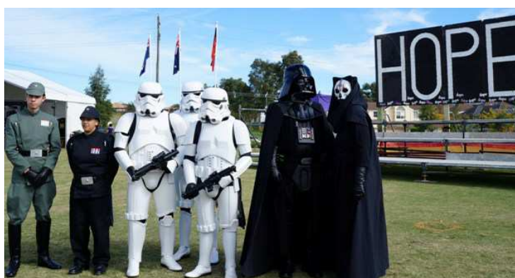
The Hills Relay for Life "May the Fourth be with You" - perhaps a Ryde team to enter next year?