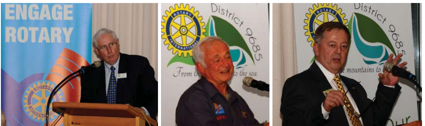
Presidents of the Riverside Zone Clubs speak about the achievements and challenges of their Clubs