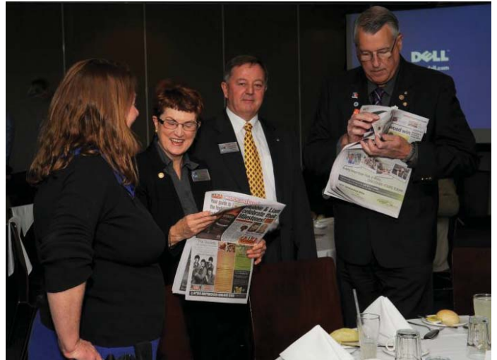
Fellowship between Clubs after the official proceedings

PLEASE SUBMIT CONTRIBUTIONS FOR THE HUB BY 5PM FRIDAY editor@ryderotary.org.au