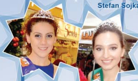
O & J Fun Dance Show