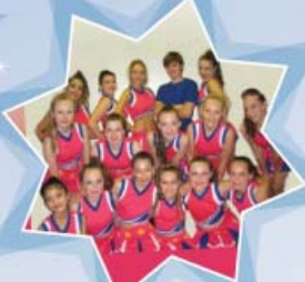
Davin Griffiths-Jones School of Performing Arts