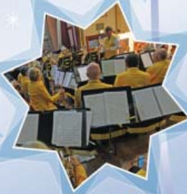
Backing by Leichhardt Celebrity Brass