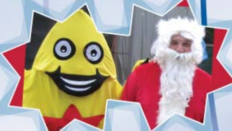
Singing Stars & Santa Claus