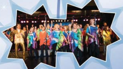
Rock'n Soul Choir