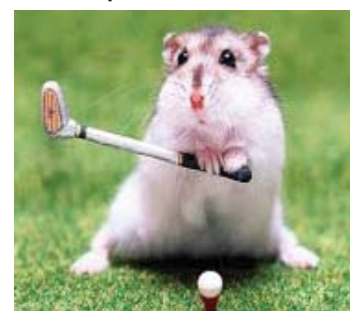
Rory McIlmouse MOA

He encourages as many of you as possible to participate in The Ryde e-Cup tournament on May 15. Registrations are open and the only way to book is at www.trybooking.com/HBNZ .