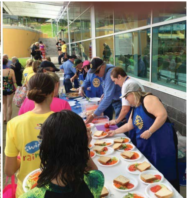
RYDE ROTARY AT THE RAINBOW CLUB INAUGURAL SWIM MEET 2015