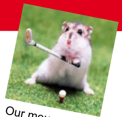
Our mouse-scot - Rory Mackelmouse