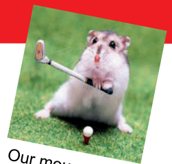
Our mouse-scot - Rory Mackelmouse