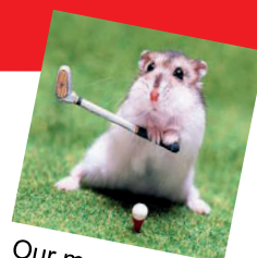
Our mouse-scot - Rory Mackelmouse