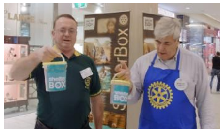
"My bucket's heavier than your bucket!"