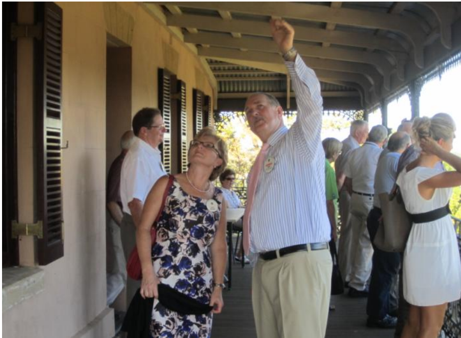
I'll jump from here and I reckon I won't even dislocate my knee.