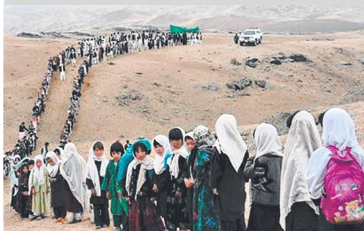
Ryde Rotary built a 1000-student Co-ed High School in Borjagai in the Hazara region of war-ravaged Afghanistan