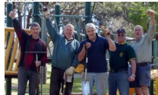
Ryde Rotarians work on local community projects as well as on International efforts to make the world a better place.

Come along to one of our club meetings. You'll be more than welcome and we'll be happy to answer your questions.