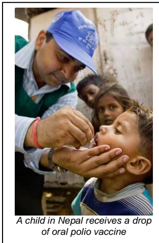
A child in Nepal receives a drop of oral polio vaccine

Polio Plus, the most ambitious program in Rotary's history, is the volunteer arm of the global partnership dedicated to eradicating polio. For more than 20 years, Rotary has led the private sector in the effort to rid the world of this crippling disease. Today, Polio Plus is recognized worldwide as a model of public-private cooperation in pursuit of a humanitarian goal. In addition to providing financial and volunteer