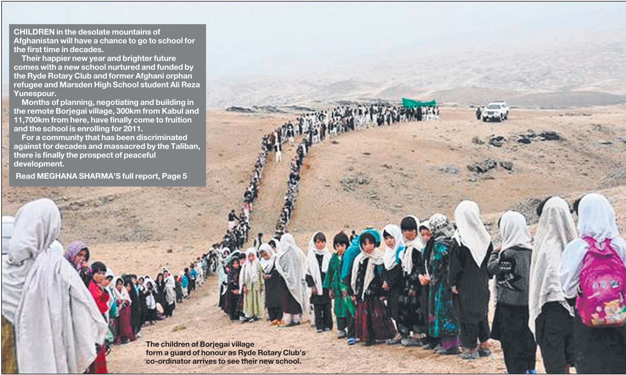
The children of Borjegai village form a guard of honour as Ryde Rotary Club's co-ordinator arrives to see their new school.