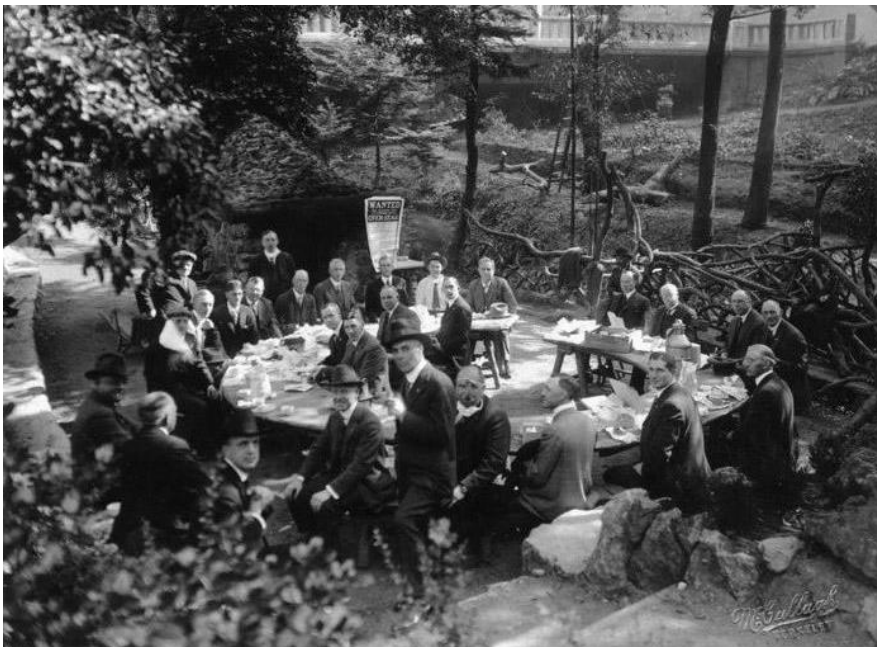
The Rotary Club of Berkeley, California, USA, meets in John Hinkel Park during the 1918 flu pandemic.